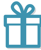
Figure out what's in it for them

Look for a correlation between their why and yours.